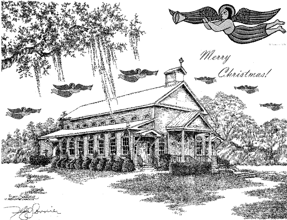
L'Église St. Patrick

December 25, 2011 - The Nativity of the Lord - Christmas