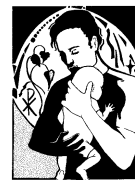
Happy Father's Day