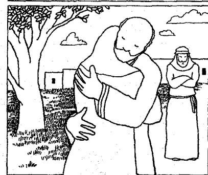
Which of the two did his father's will?